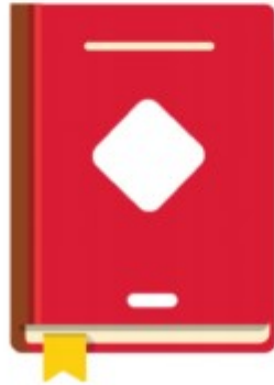
Favourite Subject in Year 6.