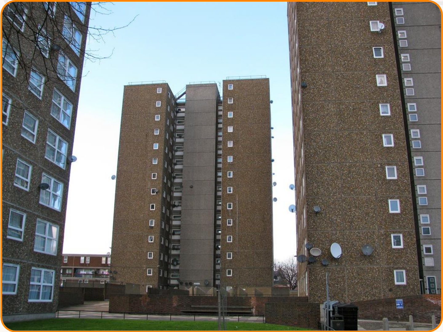
Photo courtesy of mattwils0n(@flickr) - - granted under creative commons licence - attribution