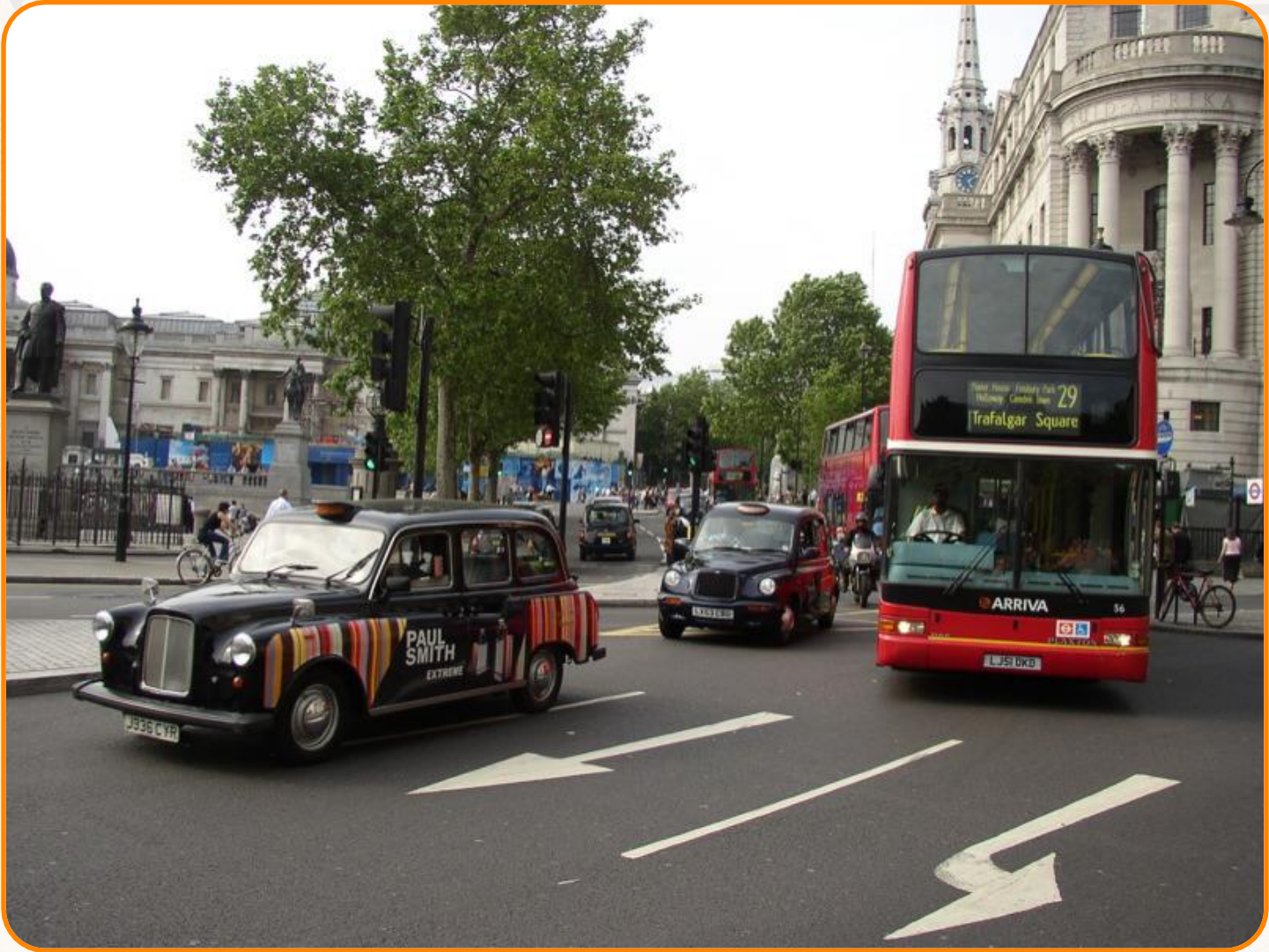
Photo courtesy of Brian Rosner (@flickr.com) - - granted under creative commons licence - attribution